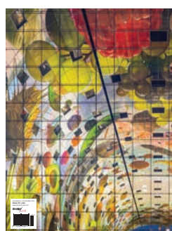
Cover (and back cover) — Rotterdam Markthal by MVRDV.