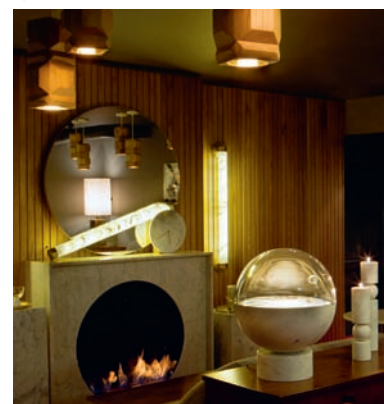
18 - Old Tom & English bar, Lee Broom